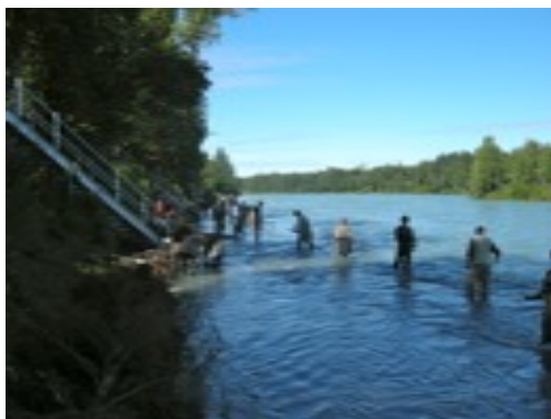
Combat fishing by Soldotna!